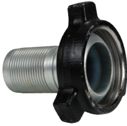
3" and 4"