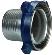
6" and 8"