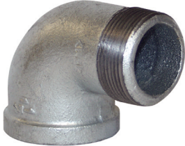
150# galvanized iron