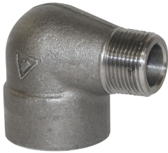
3000# forged steel