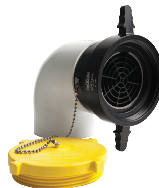
adapters and caps sold separately