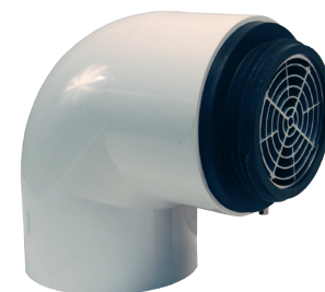
adapters and caps sold separately