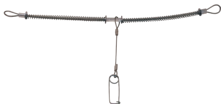
WB1C - WB1 with safety clip and lanyard