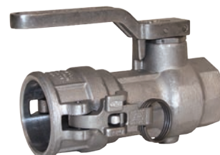
Coupler x 1-1/2" or 2" Female NPT