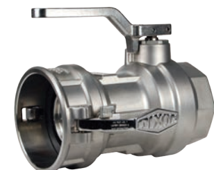
Coupler x 3" Female NPT