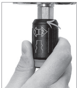
1. vents plug side