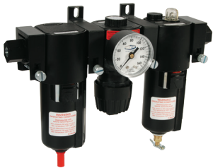
transparent bowl with guard