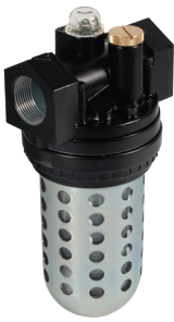
transparent bowl with guard