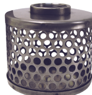
304 stainless steel