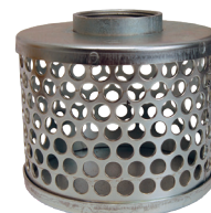
zinc plated steel