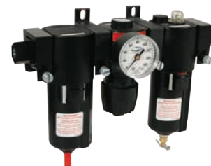
transparent bowl with guard