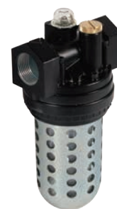
transparent bowl with guard