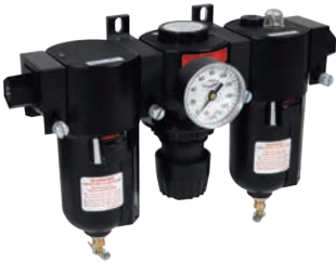
with metal bowl