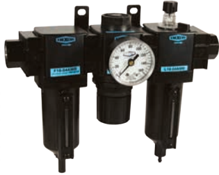
with metal bowl