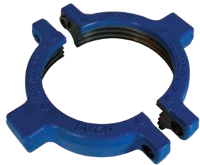
figure 200 / 206