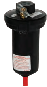
with metal bowl