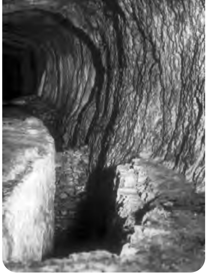
The Tunnel of Eupalinos on the Greek Island of Samos, above, is an ancient engineering marvel, spanning more than 1,200 meters (4,000 feet) through the island's mountains.

Taking careful measures along one small segment at a time, this strategy theoretically would achieve something approaching the precision of Eupalinos' tunnel. In the end, at the point where his two crews of enslaved workers met,