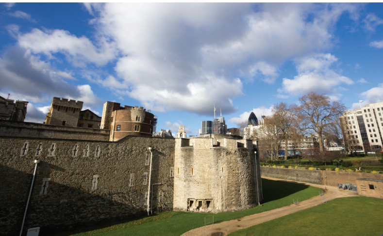
The Tower of London, one of 35 castles that William constructed.

William found him to be a just and efficient king. He established both an institution and a royal line that continues to this day.