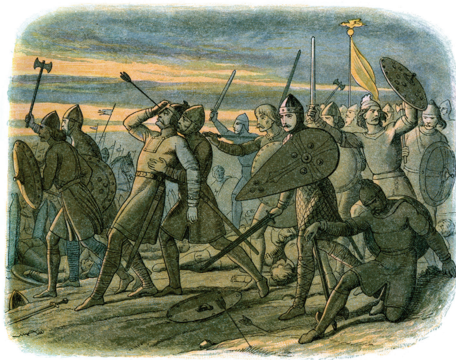
A vintage color engraving from 1864 depicts the death of King Harold at the Battle of Hastings in 1066.

William knew the strengths and weaknesses of the English forces awaiting him. They were infantry; in close combat they wielded axes with a devastating fury. However, they were vulnerable to archery and cavalry. So William recruited archers and