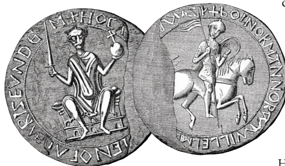
Great Seal of William the Conqueror

He ceded the province to the Viking chieftain, granting him the title of duke. In return for that prestigious title, the Viking warlord pledged his allegiance to the king and did promise to become somewhat of a Christian. By William's time, a century and five generations later, the Norsemen had become les Normandes . They now spoke French and had acquired a veneer of Gallic culture, but at heart they were still Vikings.